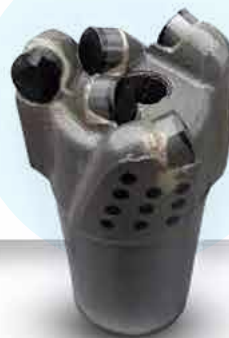
PCD NON CORE BITS