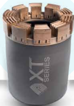
DIMATEC IMP BITS