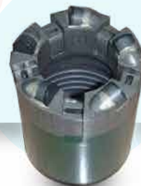
PCD CORE BITS